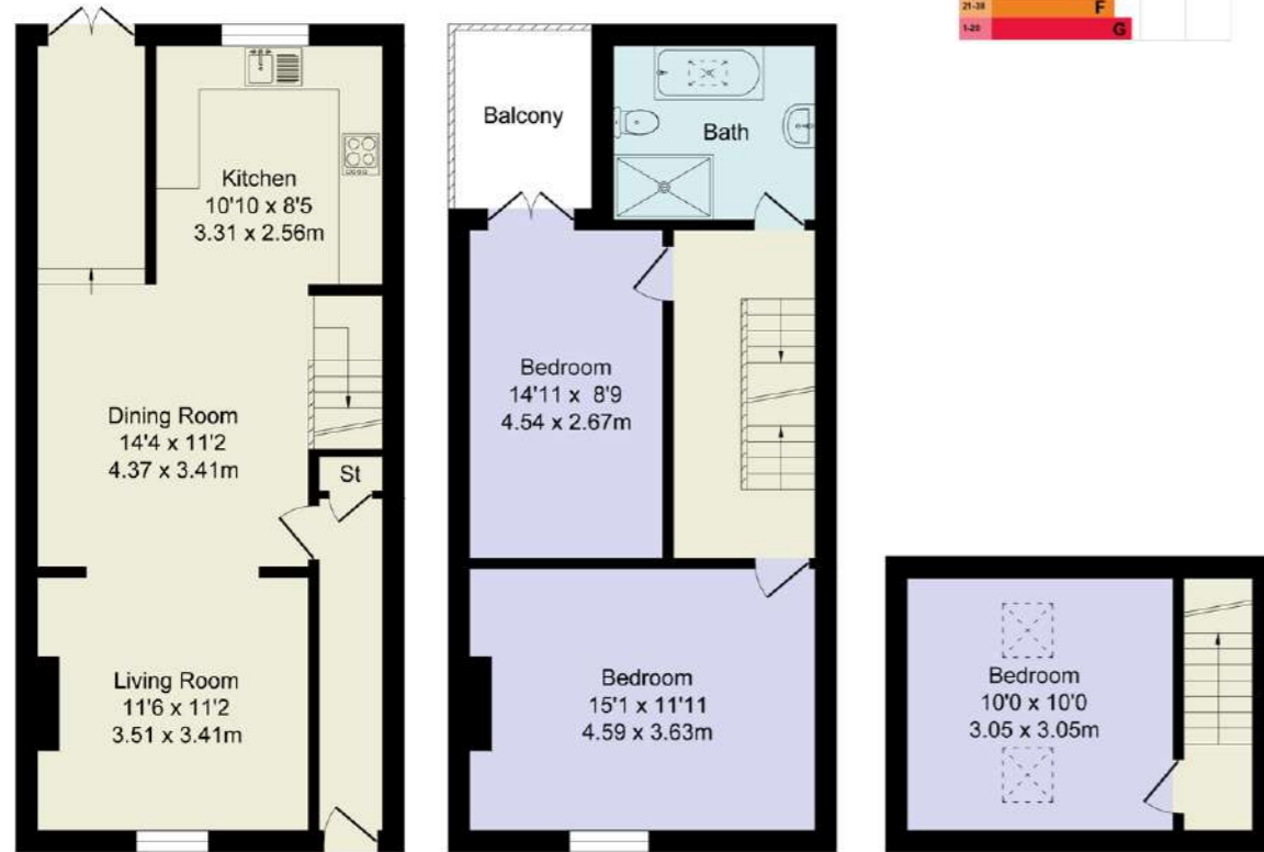
Ground Floor Approx. Floor Area 561 Sq.Ft (52.1 Sq.M.)