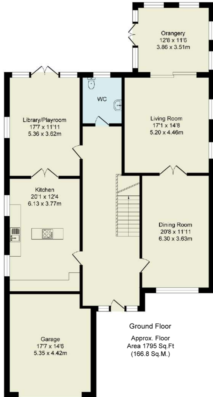
Ground Floor Approx. Floor Area 1795 Sq.Ft (166.8 Sq.M.)